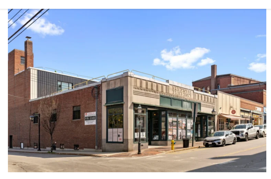
The Grant Building on Centre Street in Bath.

One of Downtown Bath's largest-ever renovation efforts is nearly finished.